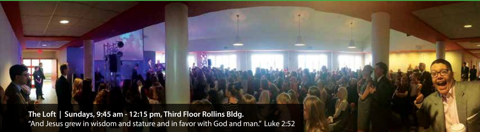
The Loft | Sundays, 9:45 am - 12:15 pm, Third Floor Rollins Bldg. "And Jesus grew in wisdom and stature and in favor with God and man." Luke 2:52

Our newly renovated space for 3rd, 4th and 5th graders has opened! Each week our children join together to learn and experience God's amazing story. More additions to The Loft will be taking place in the coming months to inspire and welcome our kids. Stay tuned for more stories of faith!