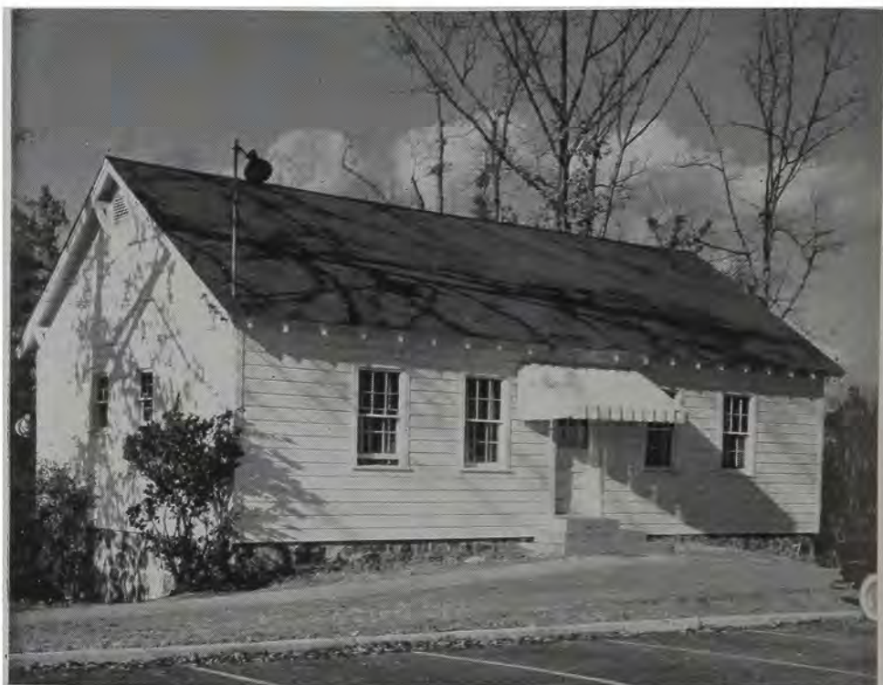
THE GIRL SCOUT HUT