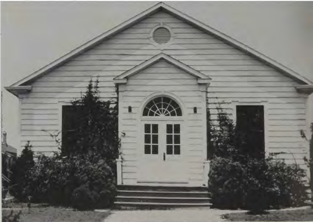
THE FIRST CHURCH AUDITORIUM

In 1942 all the temporary buildings were moved to 3180 Peachtree Road, N. E.