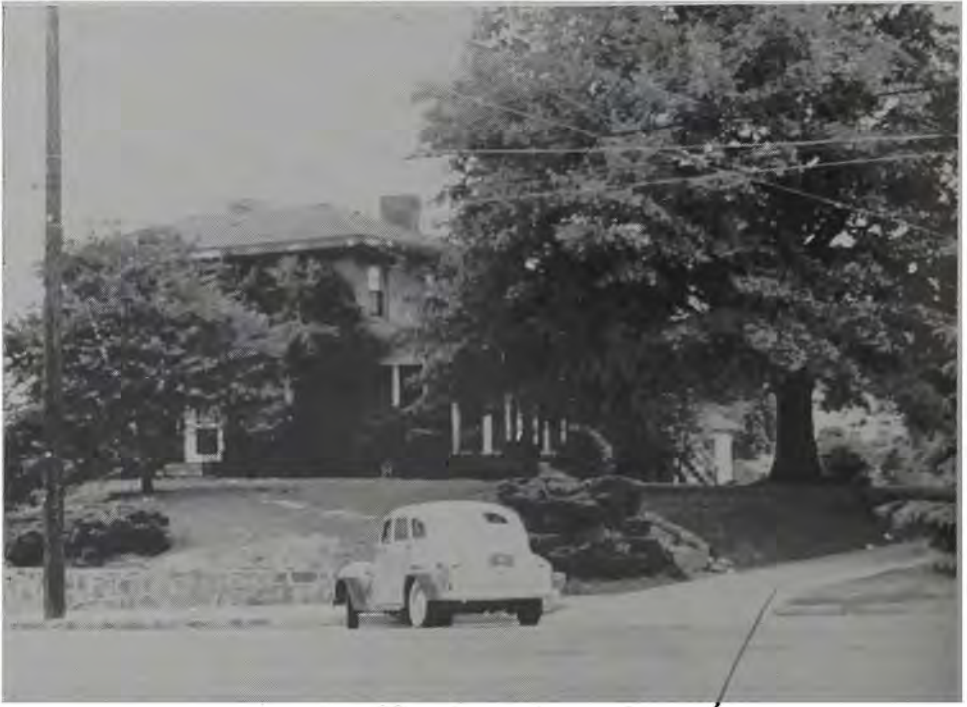
THE FIRST PARSONAGE