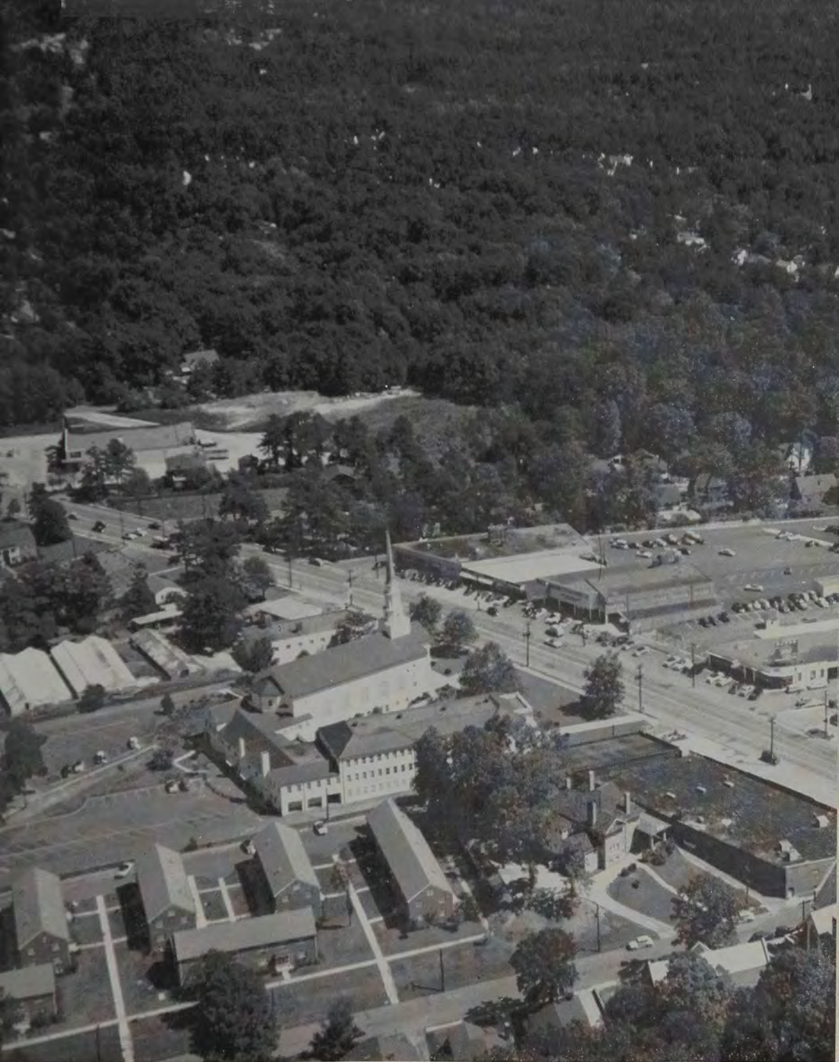
AERIAL VIEW OF CHURCH BUILDINGS