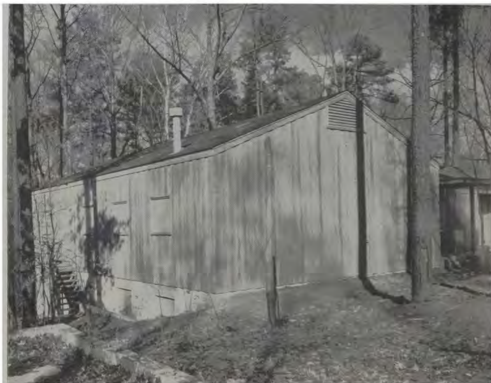
THE BOY SCOUT BUILDING

One of the significant Cub programs of each year is the widely attended Minstrel show. As of December, 1952, there were seventy-nine Cubs.