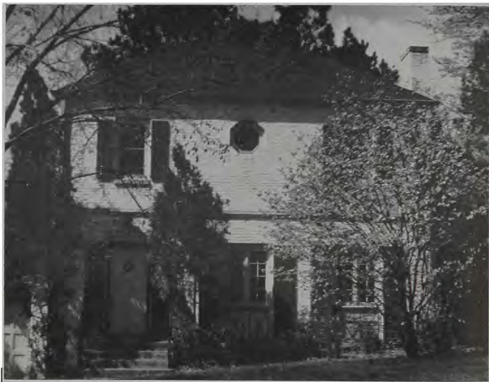
THE SECOND PARSONAGE

The first parsonage, at Peachtree Road and Sardis Way, having been sold in 1941, a new one was purchased in 1942 at a cost of $11,000, at 257 Rumson Road, N. E.