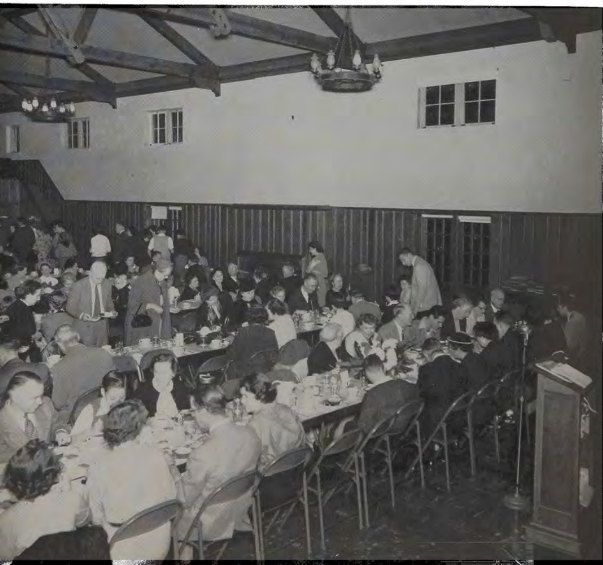
A CHURCH NIGHT DINNER IN THE GREAT HALL

On each Wednesday from the middle of September until the middle of December, and from the middle of January to the end of May, supper is served in the Great Hall at 6:30 o'clock. Sixteen hostesses from the Woman's