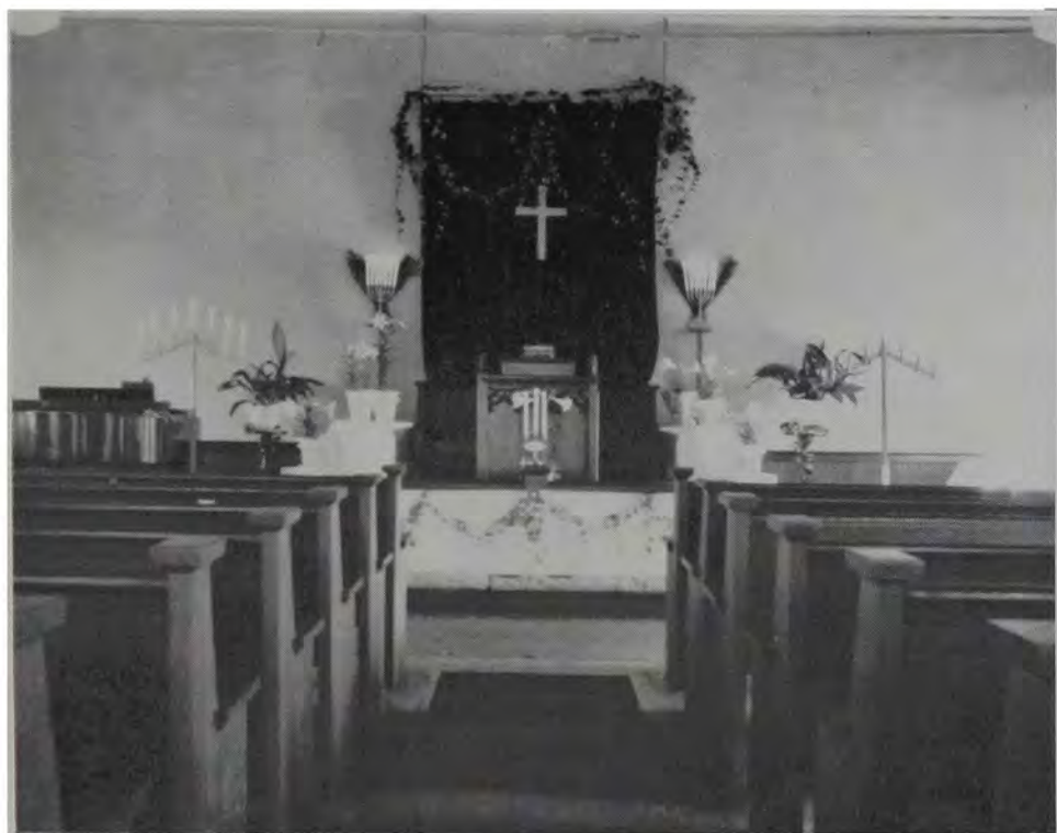
THE INTERIOR OF THE FIRST CHURCH AUDITORIUM