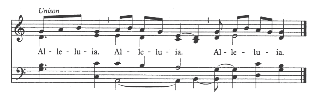
A Minister reads the Gospel.

Cantor Alleluia. Alleluia. Alleluia. People Alleluia. Alleluia. Alleluia.