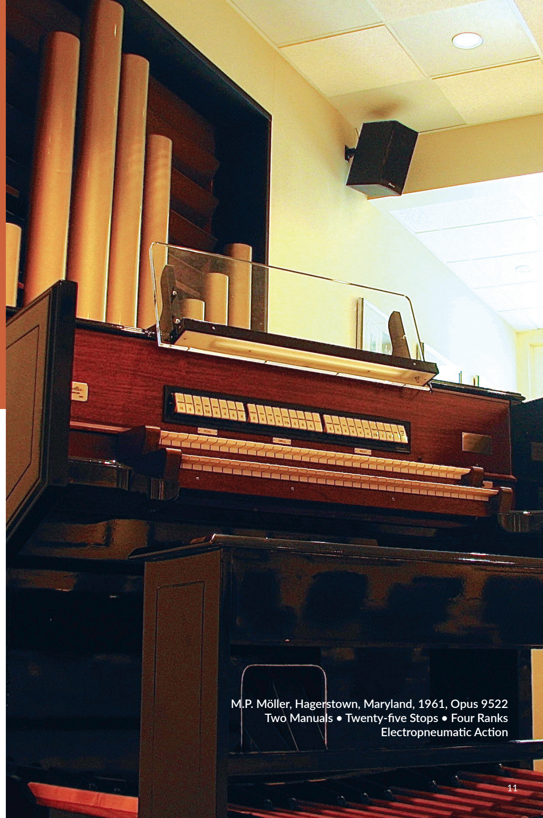
M.P. Möller, Hagerstown, Maryland, 1961, Opus 9522 Two Manuals • Twenty-five Stops • Four Ranks Electropneumatic Action