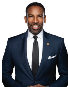
ANDRE DICKENS MAYOR